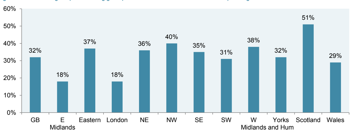
Figure Two: Percentage of parents using grandparent childcare use in last six months by GB region and nation

The tax credit system is now being merged into the single Universal Credit, with 2017 being the target date for its full implementation. Within Universal Credit the overall maximum support levels will remain, although these will be now calculated monthly. Universal Credit will also be