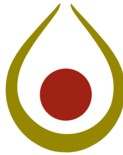
Asian Family Counselling Service