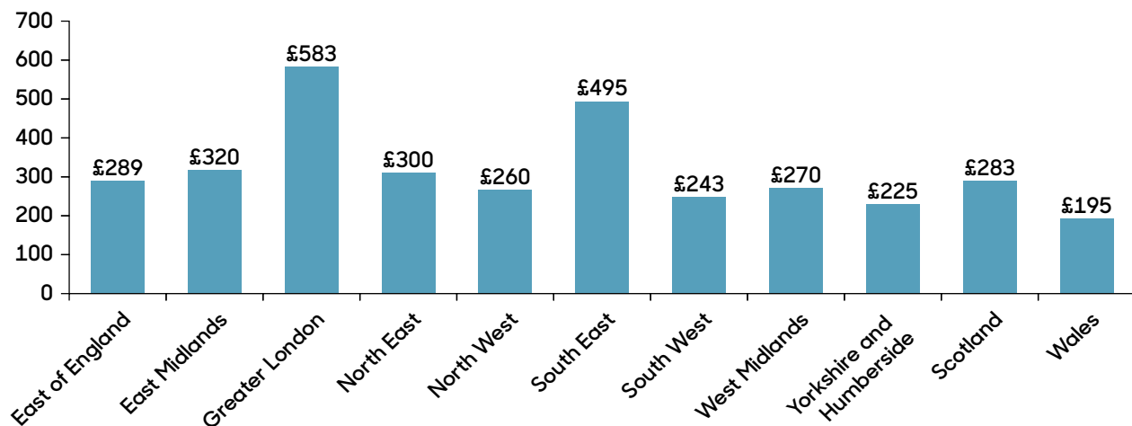
Figure Four: Most expensive holiday childcare for full-time place per week, by region, 2014

Source: Family and Childcare Trust Holiday Childcare Survey, 2015