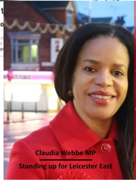
Claudia Webbe MP Standing up for Leicester East