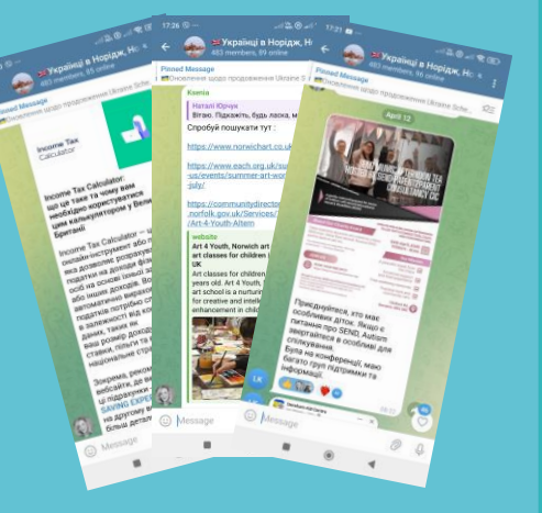
Share information on social media

Run Bounce & Rhyme groups in Libraries & other community groups