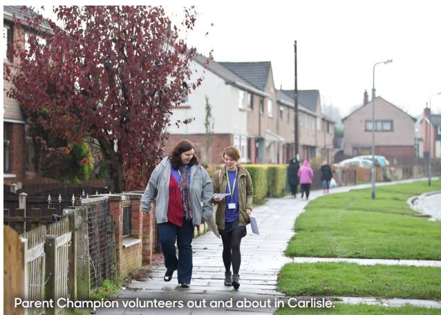
Parent Champion volunteers out and about in Carlisle.

With Department for Education funding for 2013–15 we have been able to further develop the Parent Champions National Network, including working with Action for Children to pilot a Parent Champions children's centre model. The model has also diversified beyond just childcare information with several schemes adapting it for work with health visitors, breast feeding classes, obesity and oral health interventions and parenting offers.