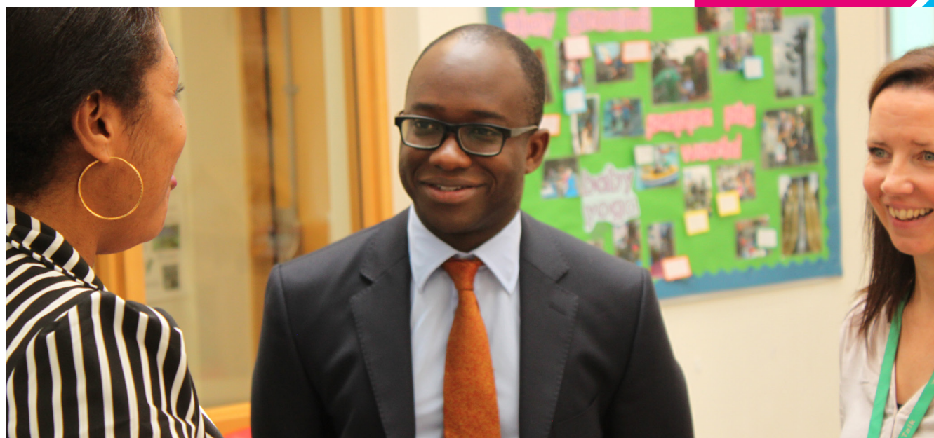
Sam Gyimah MP, Minister for Childcare, visits the Wandsworth Parent Champions scheme.