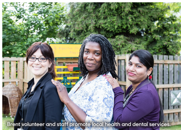
Brent volunteer and staff promote local health and dental services.

Last year, Parent Champions across the country spoke to nearly 5,000 parents. And our work has had strong impact, independently evaluated by Coram, with 70 per cent of families who have been helped by a Parent Champion now regularly using early education services, and 24 per cent accessing free childcare places for two-year-olds. 94 per cent of volunteers also rated the quality of support given by FCT rated as good or outstanding.