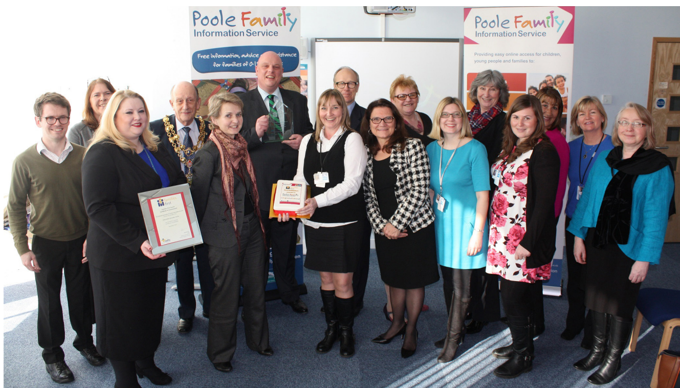
Poole Family Information Services receive their Families First Quality Award.