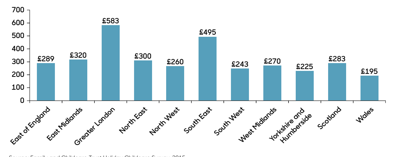
Figure Four: Most expensive holiday childcare for full-time place per week, by region, 2014